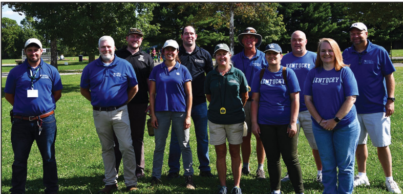
University of Kentucky Extension Team